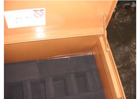
Custom foam lined storage container

Nine Mile 2 plant upgrades their QD system to add Biach's EPN and convert their stud tensioners to full hydraulic operation and add Biach's EMS elongation monitoring system. In addition, Biach is supplying a special RPV nut and washer storage rack.