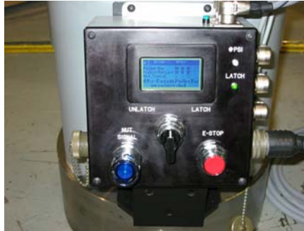
Biach's LCD Communication System

Callaway Plant is upgrading its RPV stud tensioners with Biach's LCD communication system, electronic limit switches and conversion to hydraulic piston return. Biach also upgraded their old air/hyd pump to serve as a back up to their EPN pump. A custom storage box was provided to hold their communication boxes.